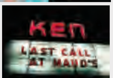
first date came to a sweet close with a cheap nightcap there).

For the record, we weren't "Maudies." We were never regulars, and by this time, we lived hundreds of miles away from The Haight. It was clear to us, though, that Maud's special story needed to be told. Our memories of the little, old bar were tinged with a sense of the magical, the mystical (and not just because our very